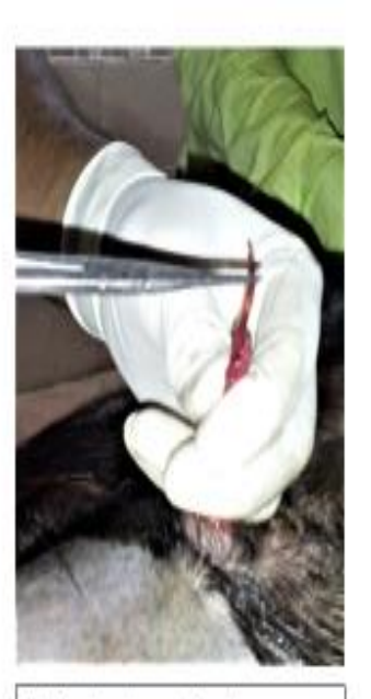
Fig.5: showing urethral process lodged with calculi in the lumen