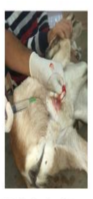
Fig. 6: Flushing of urethra in male goat with saline (Urohydropropulsion)