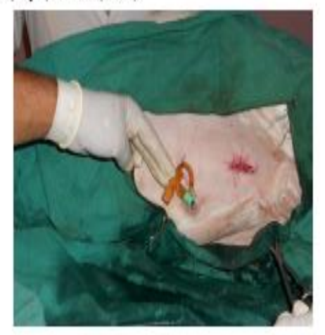
Fig.7: Diversion of urine in obstructive urolithiasis of male goat with folley's catheter (Tubecystostomy)