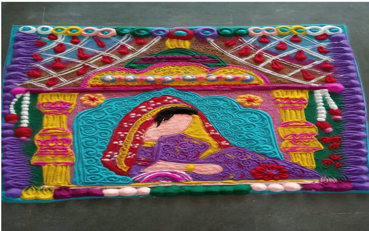
Rangoli by a BASU Student in AGRI-UNIFEST, 2019