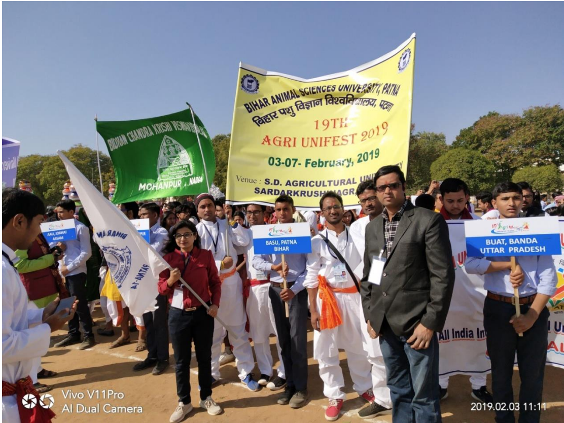
Team BASU in AGRI-UNIFEST, 2019 at Sardarkrushinagar, Dantewara, Gujarat