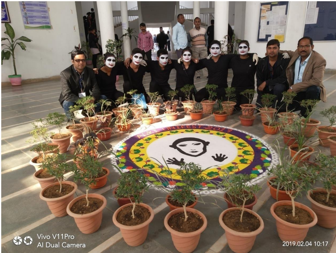
Mime Team of BASU. Team secured third position among 62 participating universities in AGRI-UNIFEST, 2019.