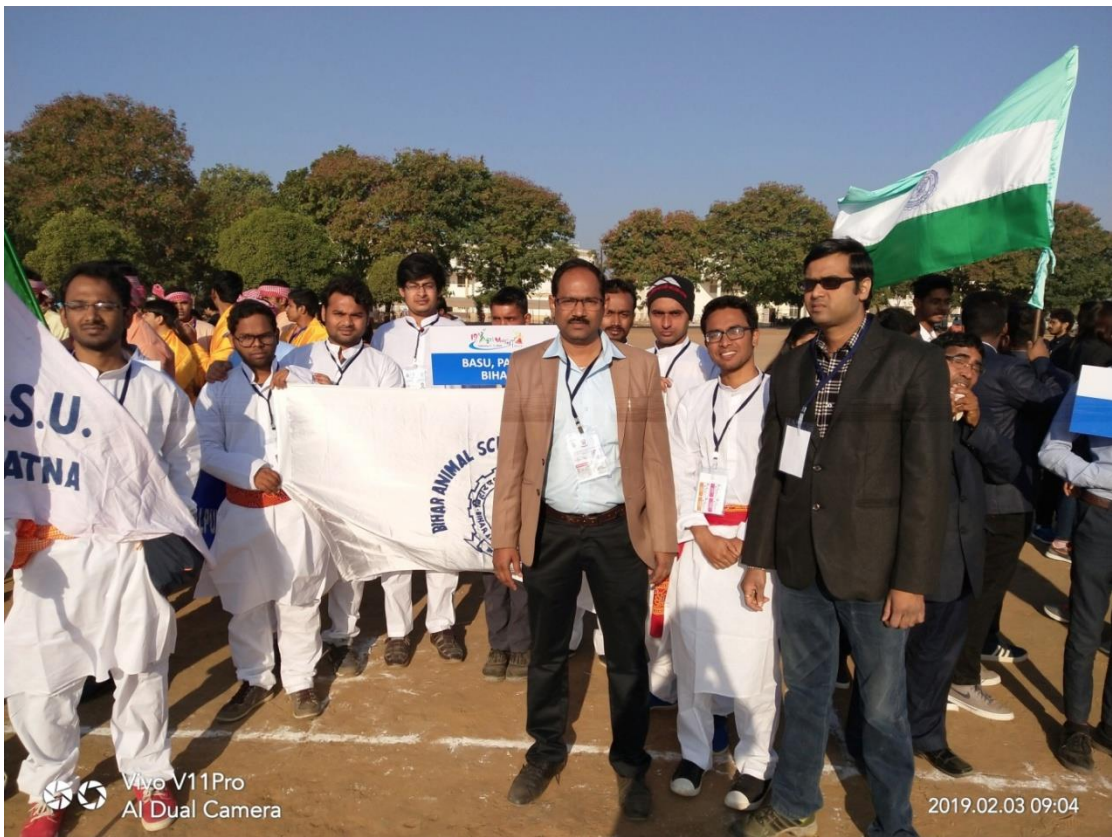
Team BASU participating in procession in AGRI-UNIFEST, 2019 at Sardarkrushinagar, Dantewara, Gujarat