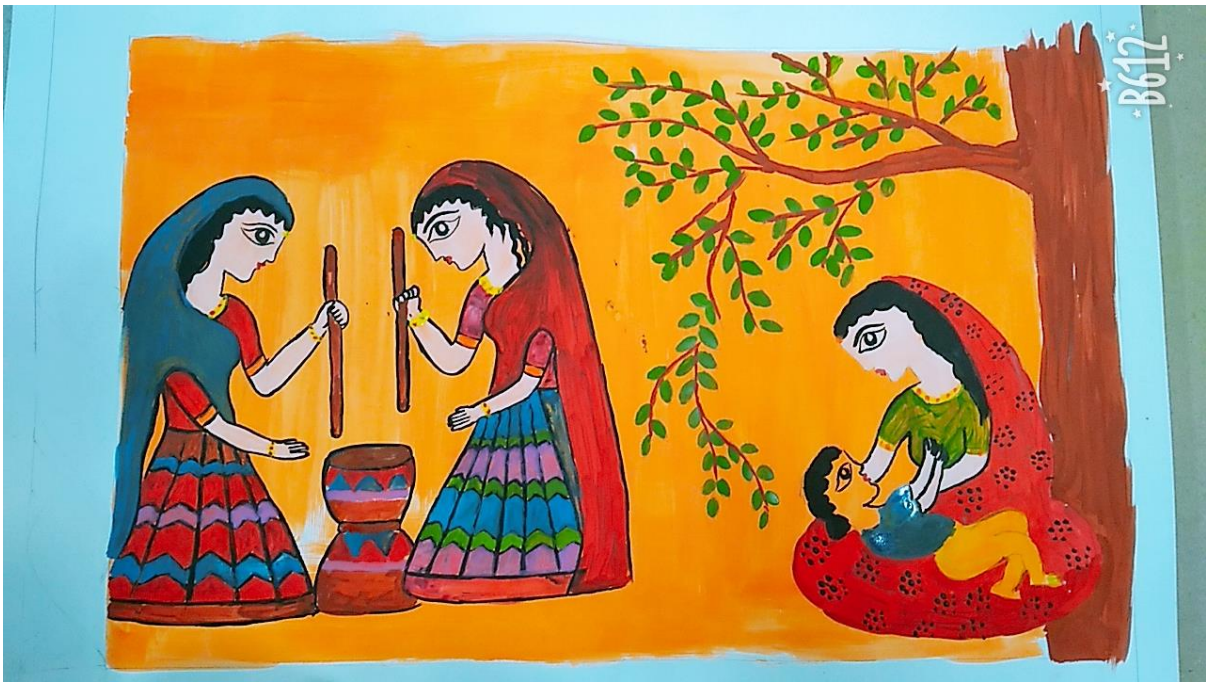
Painting of Rural India by BASU Student in AGRI-UNIFEST, 2019