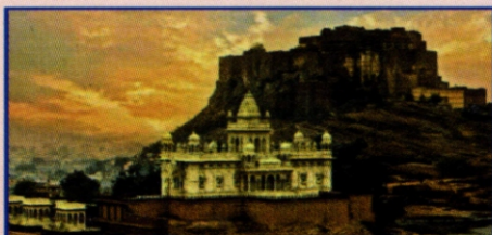
Jodhpur (337 km)