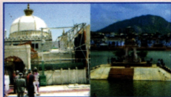
Ajmer-Pushkar (150 km)