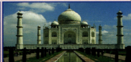
Agra (180 km)