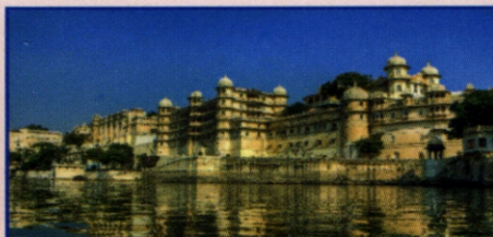
Udaipur (419 km)