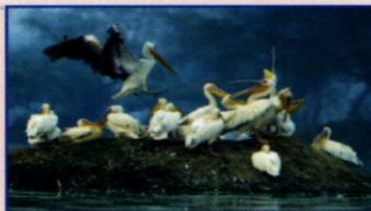
Bharatpur Bird Sanctuary (186 km)