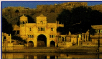
Jaisalmer (570 km)