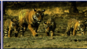
Ranthambore (135 km)