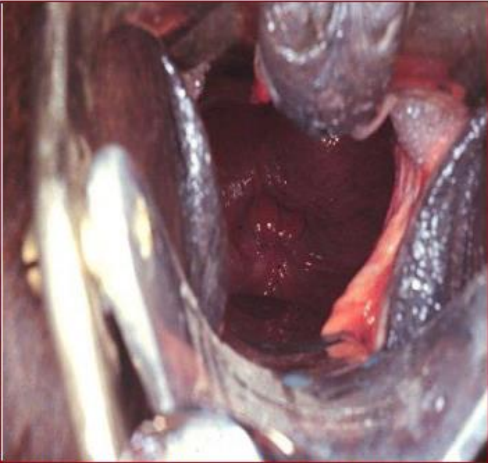
Edematous and relaxed cervix during estrus