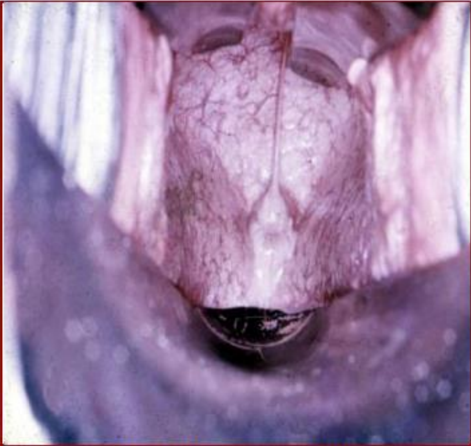
Cervix during Anestrus