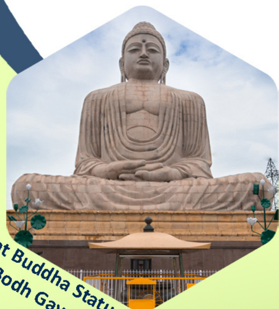
Great Buddha Statue Bodh Gaya