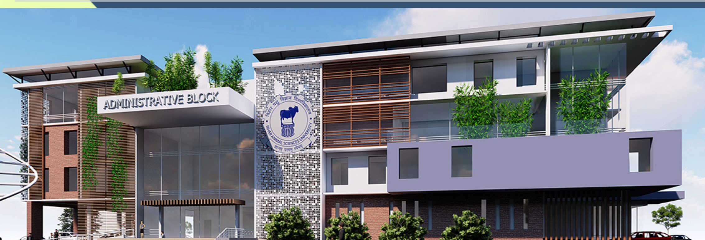
Proposed Administrative block of BASU

The Indian Association for the Advancement of Veterinary Parasitology (IAAVP) was established on 15 th February, 1986 at Patna vide Registration No. Pat. 437/86 for providing a forum on important issues related to research, education and extension activities for the benefit of scientific community, planners, policymakers, industrialists and other stakeholders.