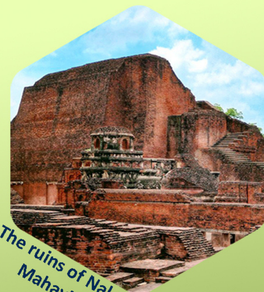
The ruins of Nalanda Mahavihara