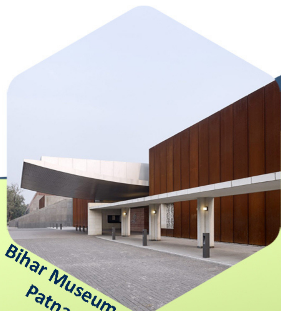
Bihar Museum Patna