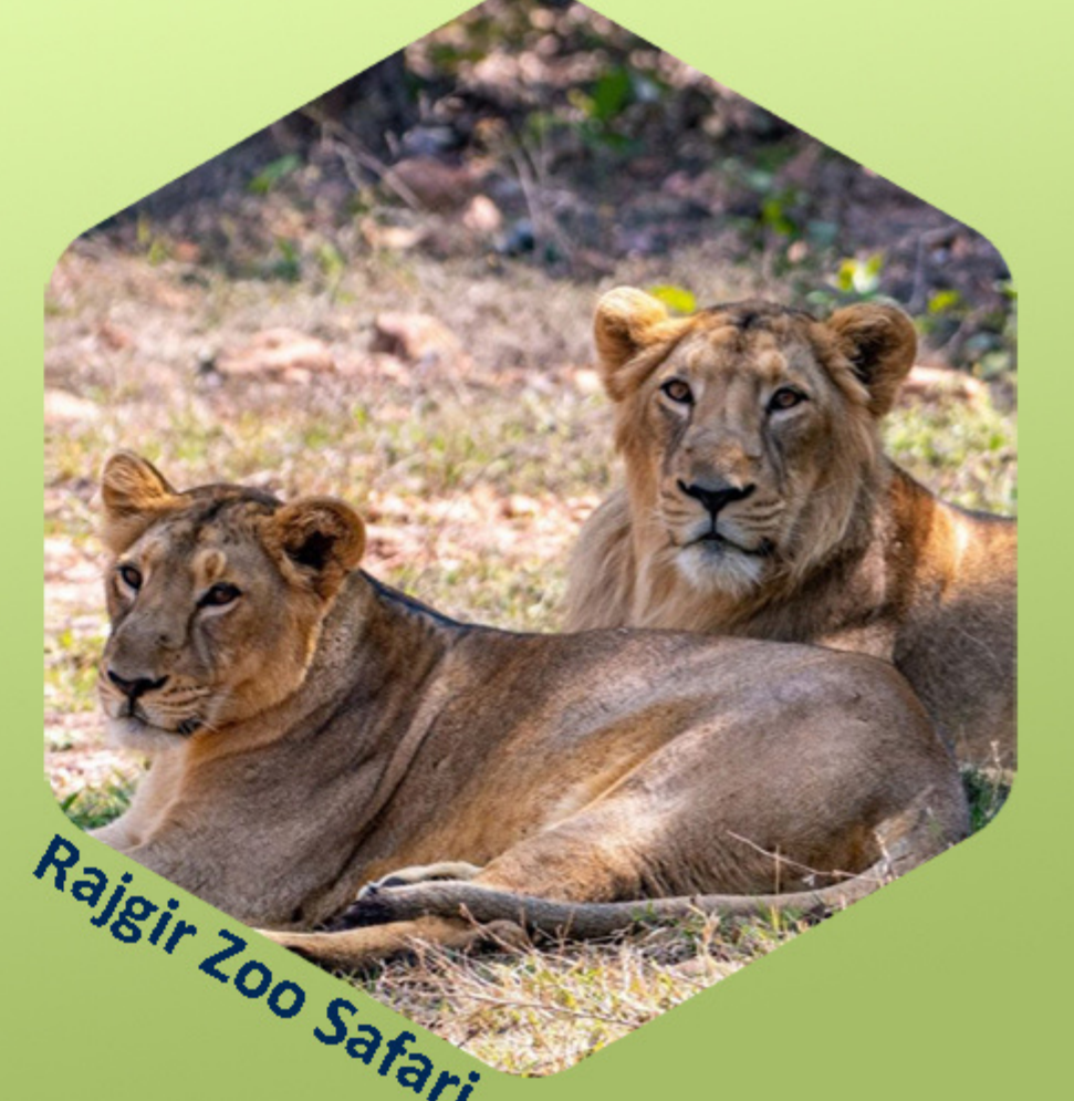
Rajgir Zoo Safari