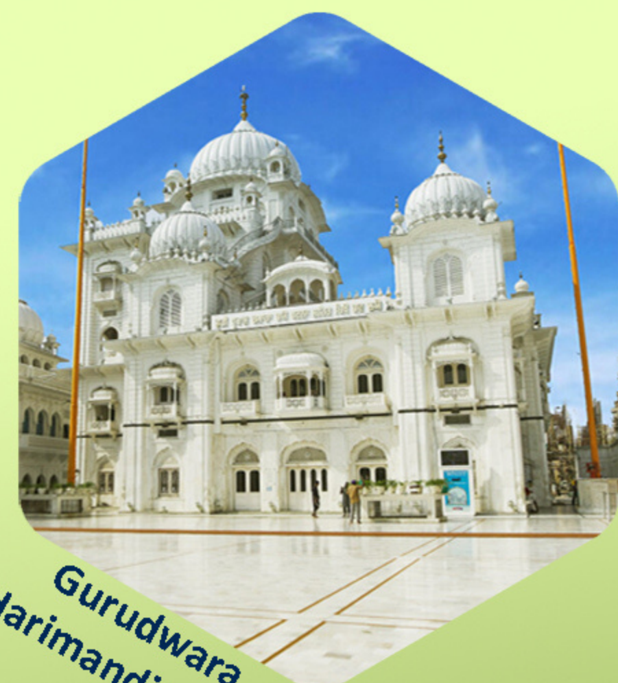
Gurudwara Harimandir Sahib