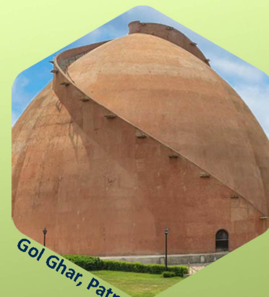
Gol Ghar, Patna